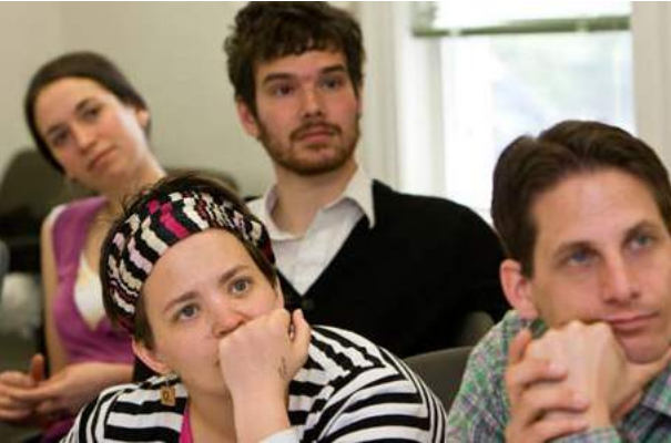
Top: During a humanitarian response training exercise, students negotiate with actors playing a rogue militia.