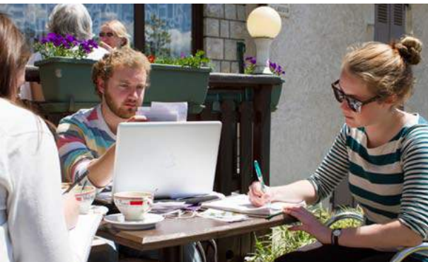
Top: Students study near the Tufts European Center in Talloires, France.