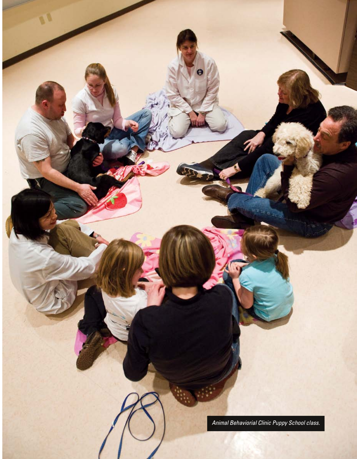
Animal Behavioral Clinic Puppy School class.

Closer to home, faculty, students, and staff from across Tufts, including the Friedman School of Nutrition Science and Policy, Cummings School of Veterinary Medicine, School of Medicine, and the Human Nutrition Research Center on Aging, are working to fight obesity. In addition to numerous scholarly publications, Tufts research