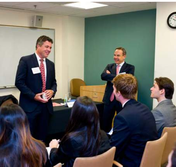
Top: Tufts alumni network in Washington, D.C.