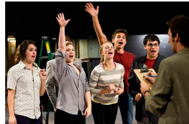
Top: Incoming students attend Matriculation ceremony. Bottom: Drama and dance rehearsal.