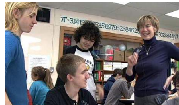
Top: Tufts students and local children participate in Kids' Day activities.