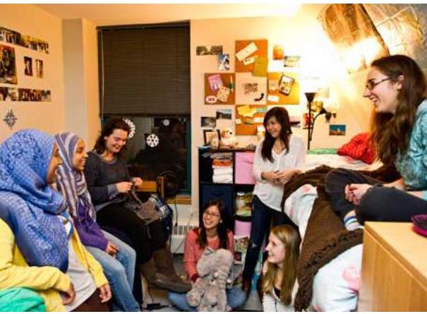
Top: A group of students socialize in South Hall.