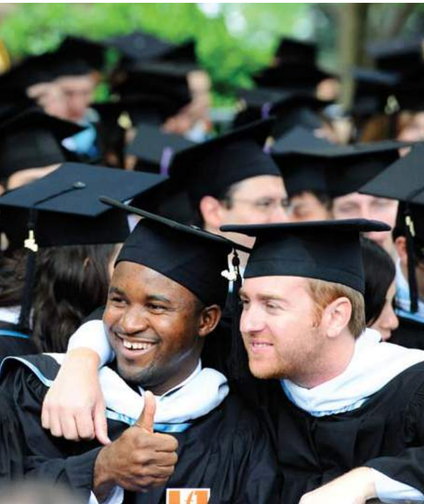
Bottom: Students celebrate at Commencement.