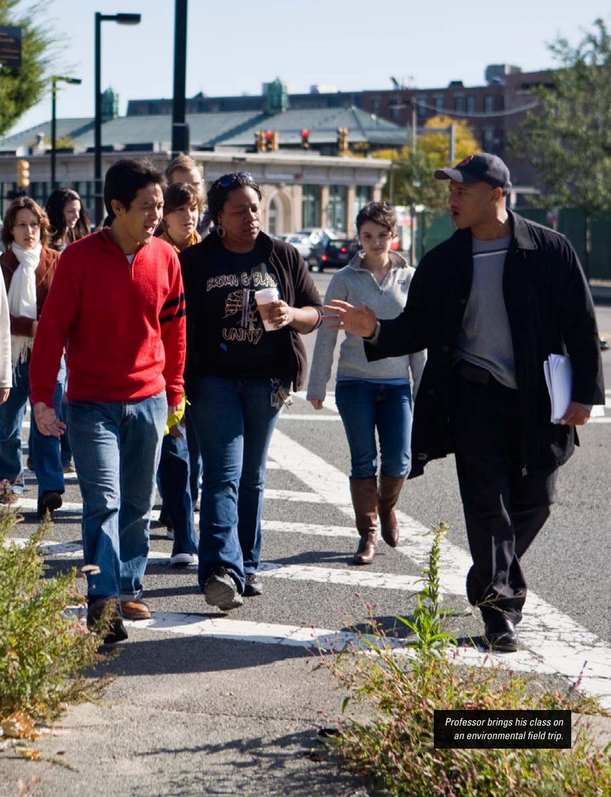
Professor brings his class on an environmental field trip.

and schools that have an impact on the world. For example, the cognitive science program, an interdisciplinary effort to understand and explain the mind, draws on perspectives from such fields as psychology, computer science, philosophy, linguistics, anthropology, neuroscience, and biology. With the involvement of some of Tufts' most-accomplished humanists, social scientists, and engineers, cognitive science is a paradigmatic research and educational program with enormous potential for scientific and global impacts.