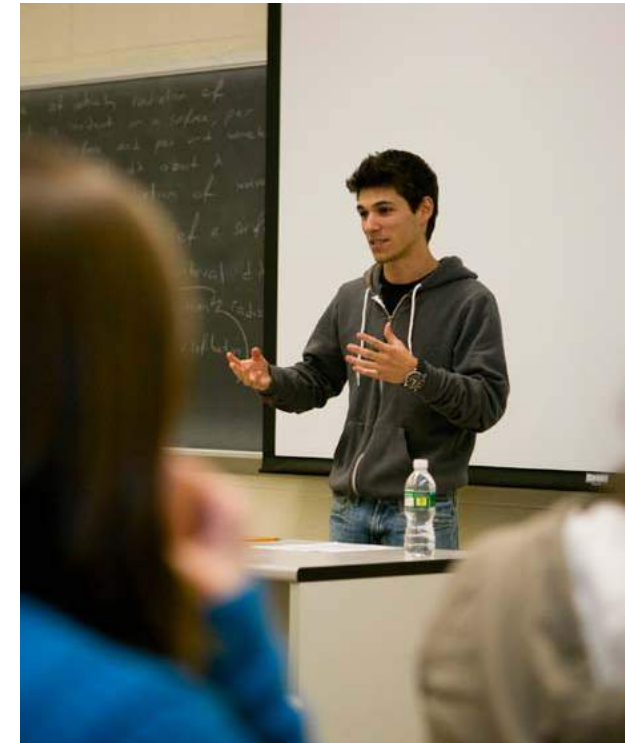
Top: Tufts University Research Day Poster Presentation.