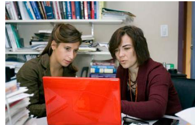
Top: Staff member explains the VisWall.