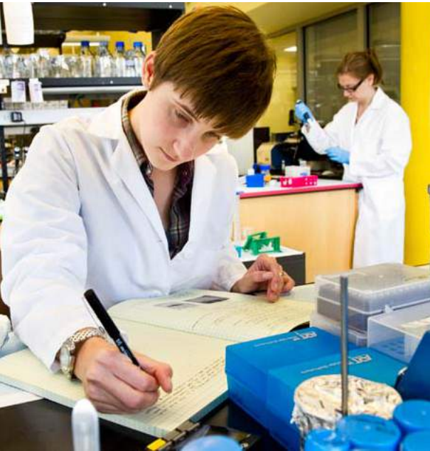
Top: Students participate in the Entrepreneurial Leadership Program. Bottom: Collaborative research in health sciences lab.

2. Enhance the resources required to nurture innovation and an entrepreneurial spirit. Tufts already has many resources focused on inspiring and cultivating an innovative and entrepreneurial spirit among students and faculty. Examples include the Entrepreneurial Leadership Studies (ELS) program, which awards a minor and engages hundreds of undergraduates each year; the Tisch College of Citizenship and Public Service, which facilitates social entrepreneurship among dozens of undergraduates, graduate students, and faculty each year; and the Office for Technology Licensing and Industry Collaboration, which works with faculty to identify and market their discoveries.