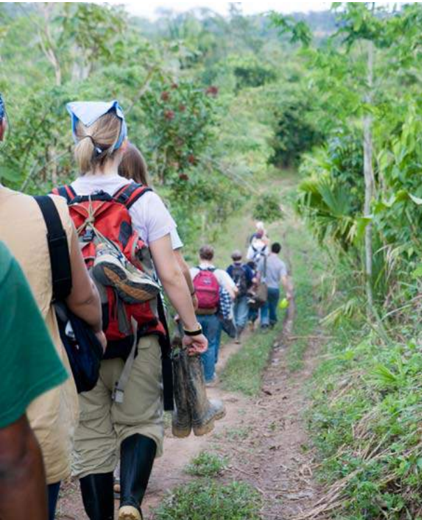
Top: Tufts students travel to Nicaragua.

A cornerstone of Tufts' mission is to create a community of exceptional faculty, staff, and students from a range of backgrounds and perspectives, in which all individuals can achieve their full potential, and the community achieves far more than would be possible in a more homogeneous setting. Over the next 10 years, Tufts will demonstrate unprecedented institutional commitment to diversity, inclusion, and cultural competency, and renew its commitment to global activities and engagements. This process began with the 2012 convening of the President's Council on Diversity and will continue as the council's recommendations are debated and implemented. The future viability of higher education will hinge on reckoning openly with the challenges and opportunities of accessibility, diversity, and inclusion.