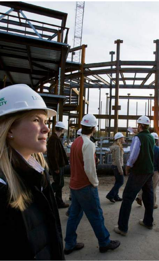
Professors use campus construction projects as an interactive classroom.

// All students are provided with opportunities to acquire and apply an entrepreneurial perspective across a broad range of intellectual areas and real-world applications. //