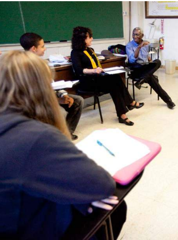
Top: Students volunteering in the local community.