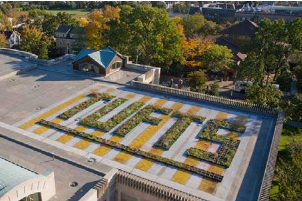
Top: Faculty react to the renovation renderings of 574 Boston Avenue. Bottom: Tufts displays its spirit on the rooftop of Tisch Library.

technology and have seats that can be arranged in multiple configurations. Similarly, we can be successful in pursuing innovative research only if we have the space required for scholars to conduct experiments, create installations, and engage with current and potential collaborators. Tufts is addressing this critical enabling need by developing a five-year capital plan in conjunction with the strategic plan and the recommendations outlined in the President's Campus Sustainability Council Report. To assist in funding these projects, we have issued $250 million in century bonds that will provide substantial resources for capital investment in academic facilities, renovations, deferred maintenance, and information technology. Additional resources will result from the implementation of cost-saving sustainability projects, TEAM and the upcoming university fundraising campaign.