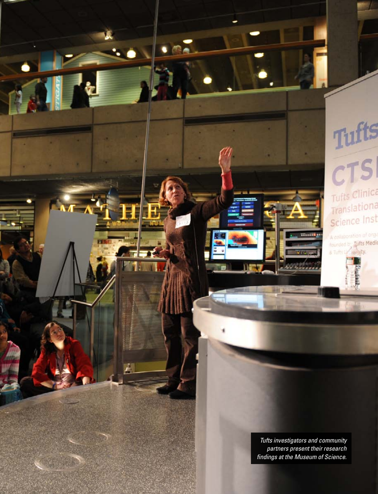
Tufts investigators and community partners present their research findings at the Museum of Science.

response to the frightening and terrible events following the Boston Marathon attacks. As Tufts embarks on the next 10 years, we will continue to value our staff and work to create an environment that enhances our culture of pride, trust, commitment, and rewarding work.