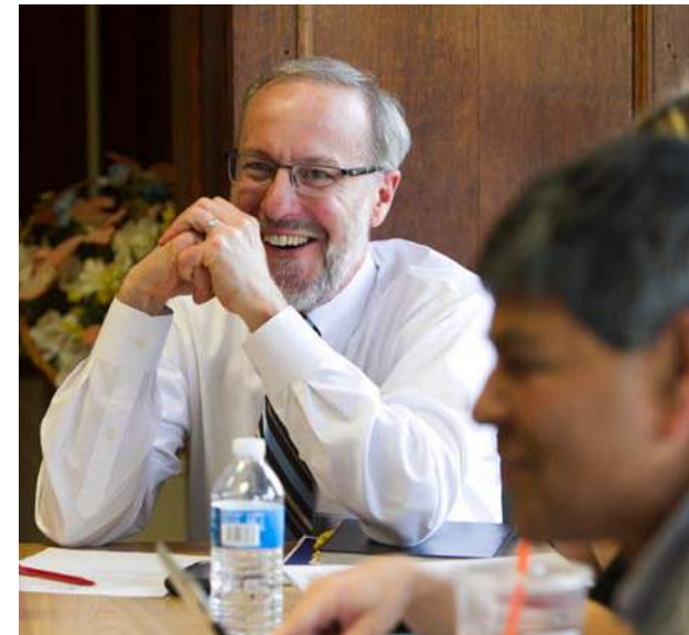
Staff engage in the T10 strategic planning process.